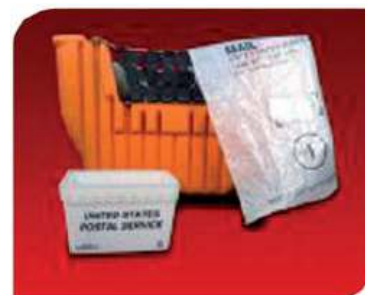
Multiple output options including tubs, sacks, gondolas and gaylords.