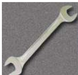
Ease of maintenance Extensive diagnostics